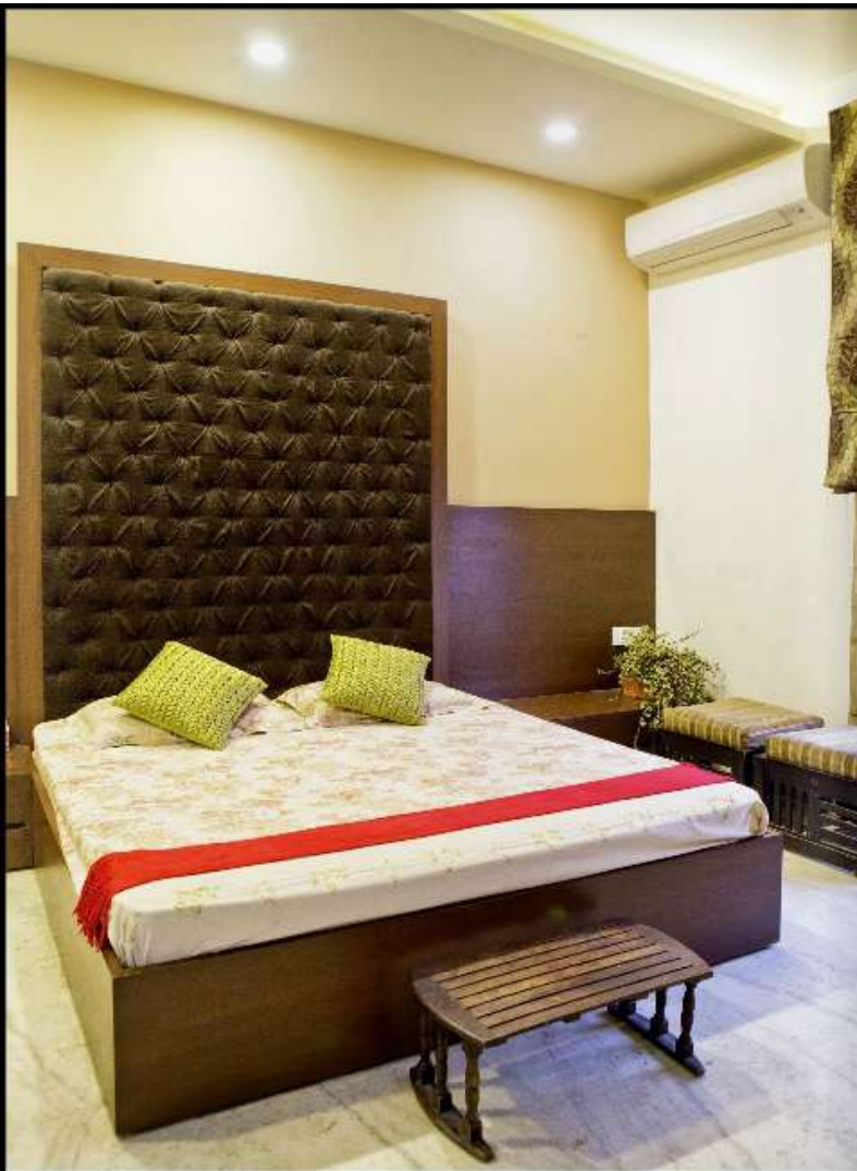
76 | PRISMMA ISSUE 18 : DESI DESIGN

Warm earthy tones are used in the master bedroom which benefits from the view of the greenery facing the apartment as it is situated in one corner, towards the front portion.